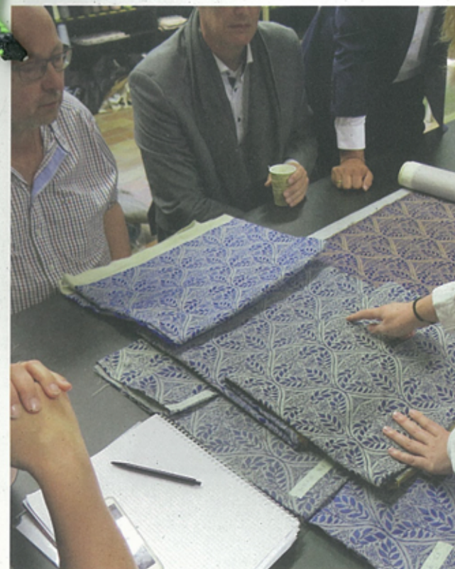
inspiration from the archives

'The TextielLab collaborated with us from conception to final product'