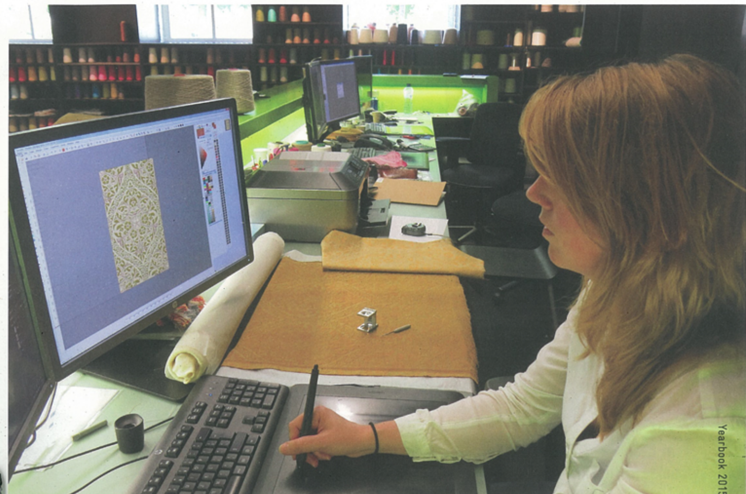
heritage pattern - modern technique